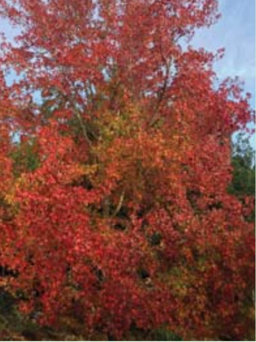
Pick a few branches from a liquid amber tree to enhance your interiors.

Thank you, thank you for being my special gardening gang. I am humbled to be your guide on the side. There is no such thing as a brown thumb, just one that hasn't turned green yet!